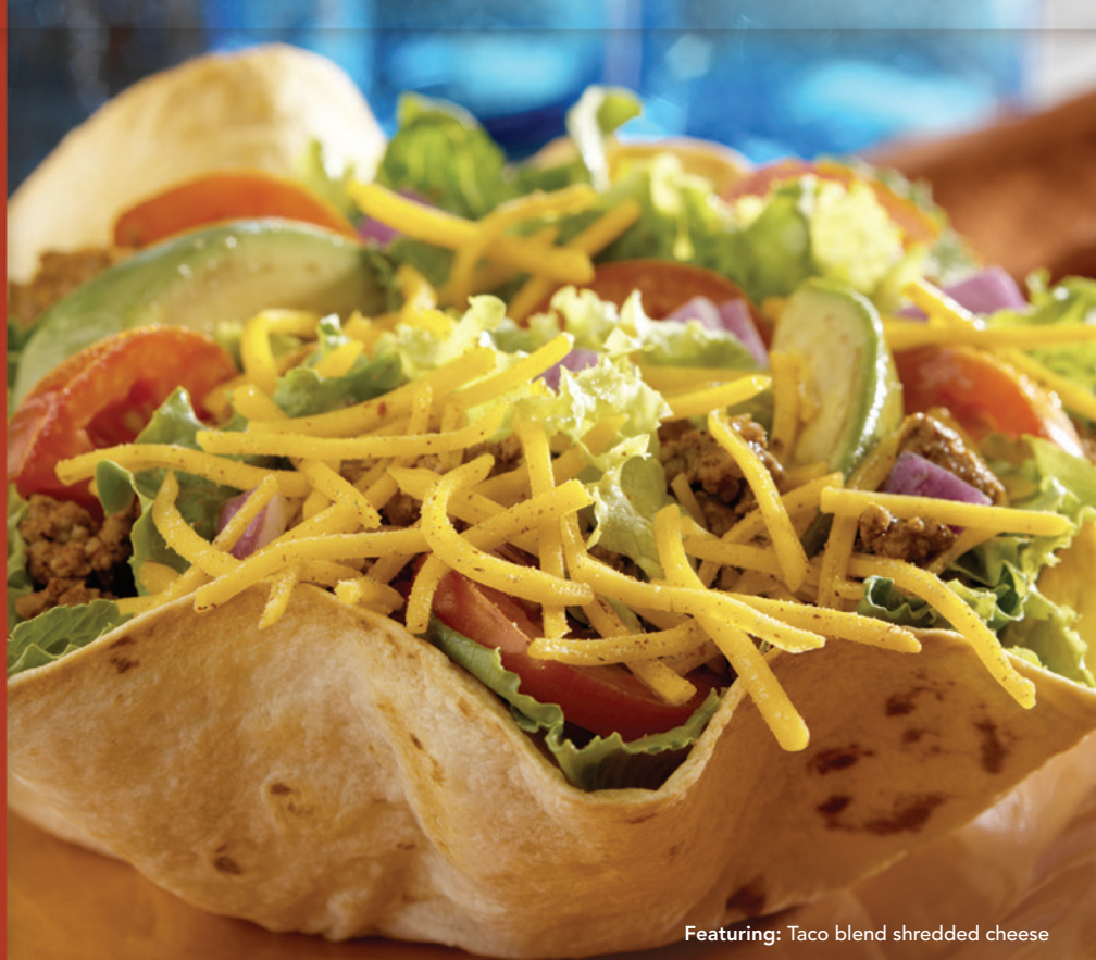
Featuring: Taco blend shredded cheese